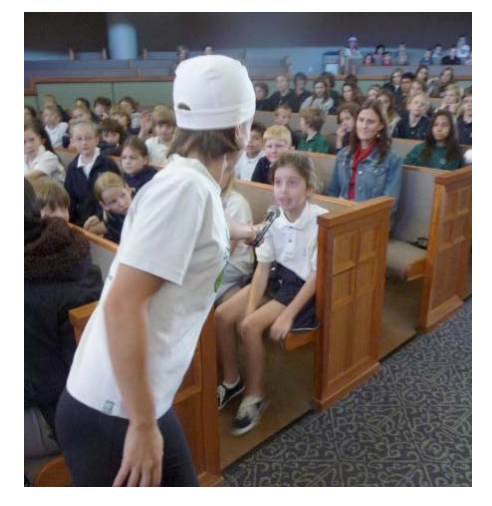
Taking the Action Challenge at Calvalry Christian School in Pacific Palisades.