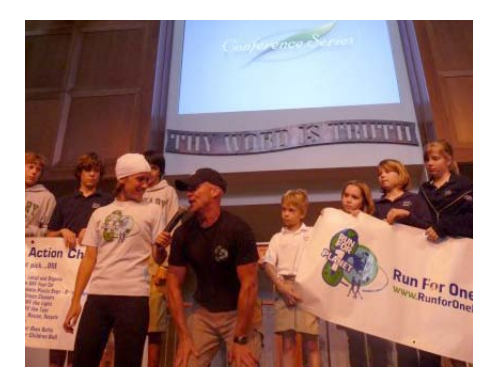
Taking the Action Challenge at Calvalry Christian School in Pacific Palisades.